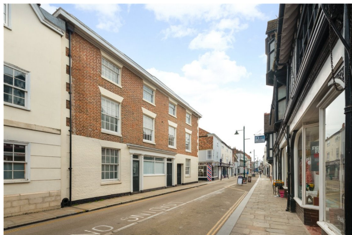
1 NEVILLE HOUSE, HIGH STREET ST GREGORYS, CANTERBURY, CT1 £175,000 LEASEHOLD

Canterbury | 01227 456 645 | canterbury@winkworth.co.uk