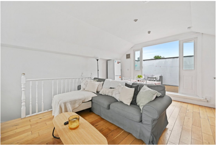
LOFTUS ROAD, SHEPHERDS BUSH, LONDON, W12 £807.69 PER WEEK FURNISHED, PART FURNISHED £3,500 PER CALENDAR MONTH

An extremely well proportioned four double bedroom flat with private roof terrace. Furnished, available 26th August 2023