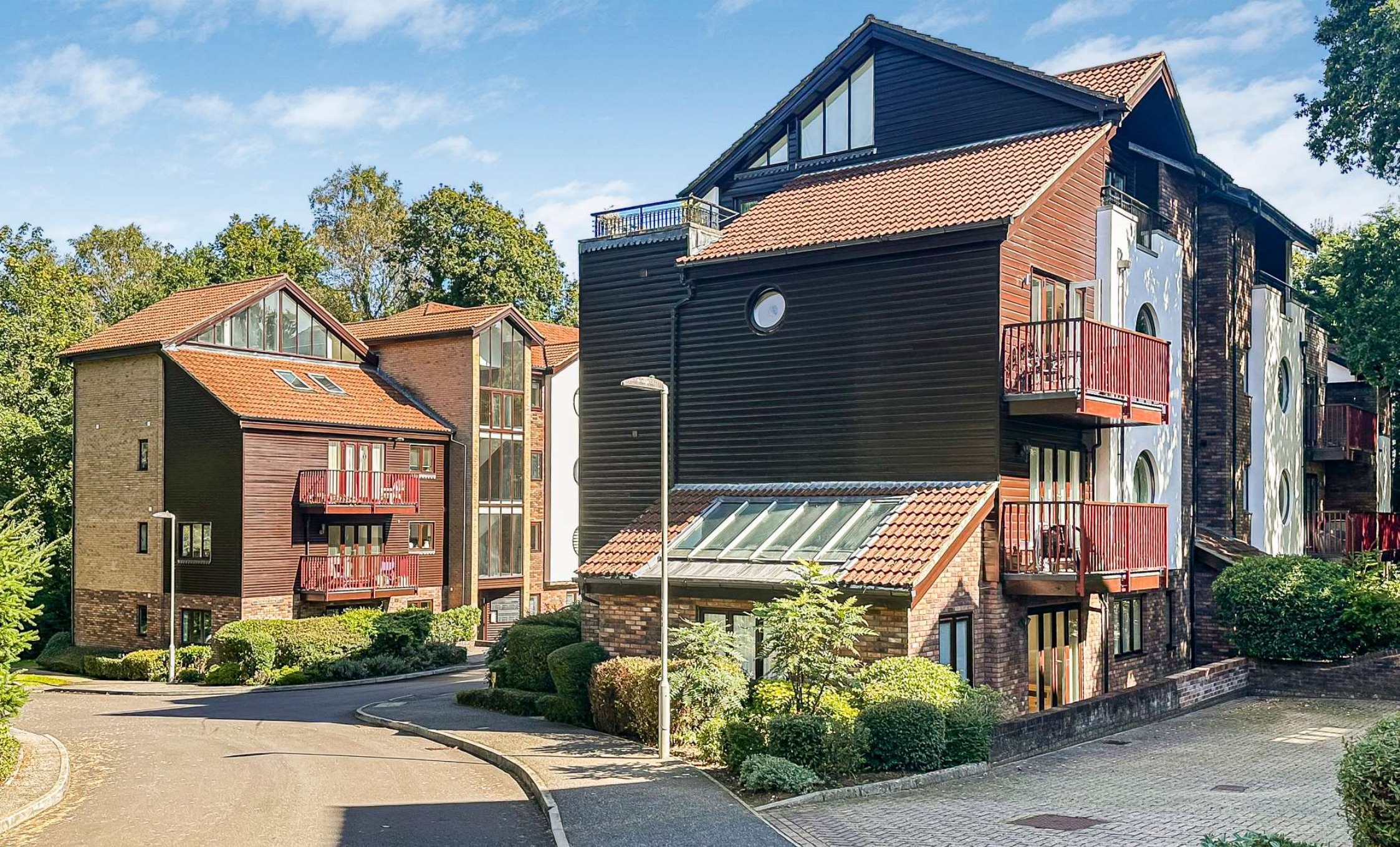
Horton House, Coach House Mews Ferndown BH22 9UY Offers Over £350,000