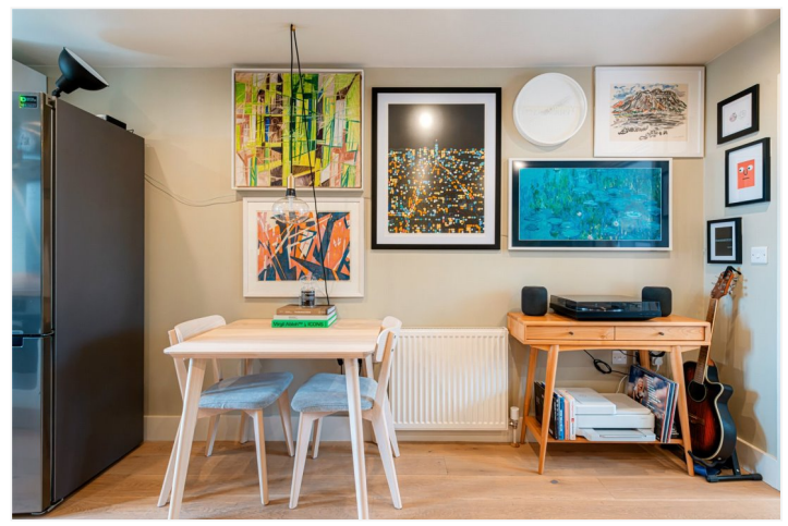
TAVISTOCK CRESCENT, LONDON, W11 £399,950 LEASEHOLD