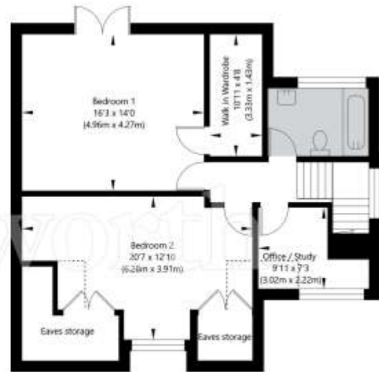
First Floor GROSS INTERNAL FLOOR AREA APPROX. 72.39 SQ M / 779 SQ FT

APPROXIMATE GROSS INTERNAL FLOOR AREA 193.11 SQ M / 2078 SQ FT APPROXIMATE GROSS INTERNAL FLOOR AREA EXCLUDING RESTRICTED HEIGHT 185.97 SQ M / 2001 SQ FT