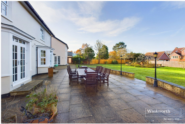
READING ROAD, READING, BERKSHIRE, RG7 3BH OFFERS IN EXCESS OF £1,250,000 FREEHOLD