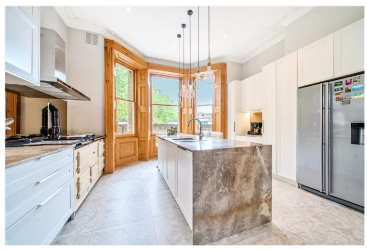
LEAMINGTON ROAD VILLAS, W11 £2,307.69 PER WEEK (£10,000.00 PCM) PART FURNISHED

THIS WONDERFULLY SPACIOUS 4 BEDROOM GARDEN MAISONETTE WITH ITS OWN FRONT DOOR IN THIS FABULOUS CORNER BUILDING STEEPED IN HISTORY AND FORMALLY A VICARAGE.