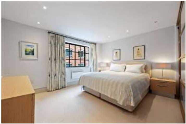
KEAN STREET, LONDON, WC2B £750,000

A BEAUTIFULLY PRESENTED ONE BEDROOM APARTMENT WITH SHARE OF FREEHOLD ON THE FOURTH FLOOR OF A MODERN WAREHOUSE DEVELOPMENT IN KEAN STREET, COVENT GARDEN.