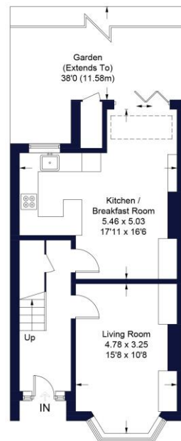
Ground Floor Sq m 46.9 / Sq ft 505