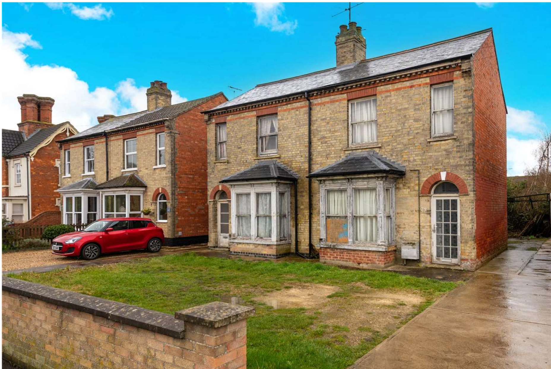
NORTH ROAD, LINCOLNSHIRE, PE10 9BT £200,000 FREEHOLD