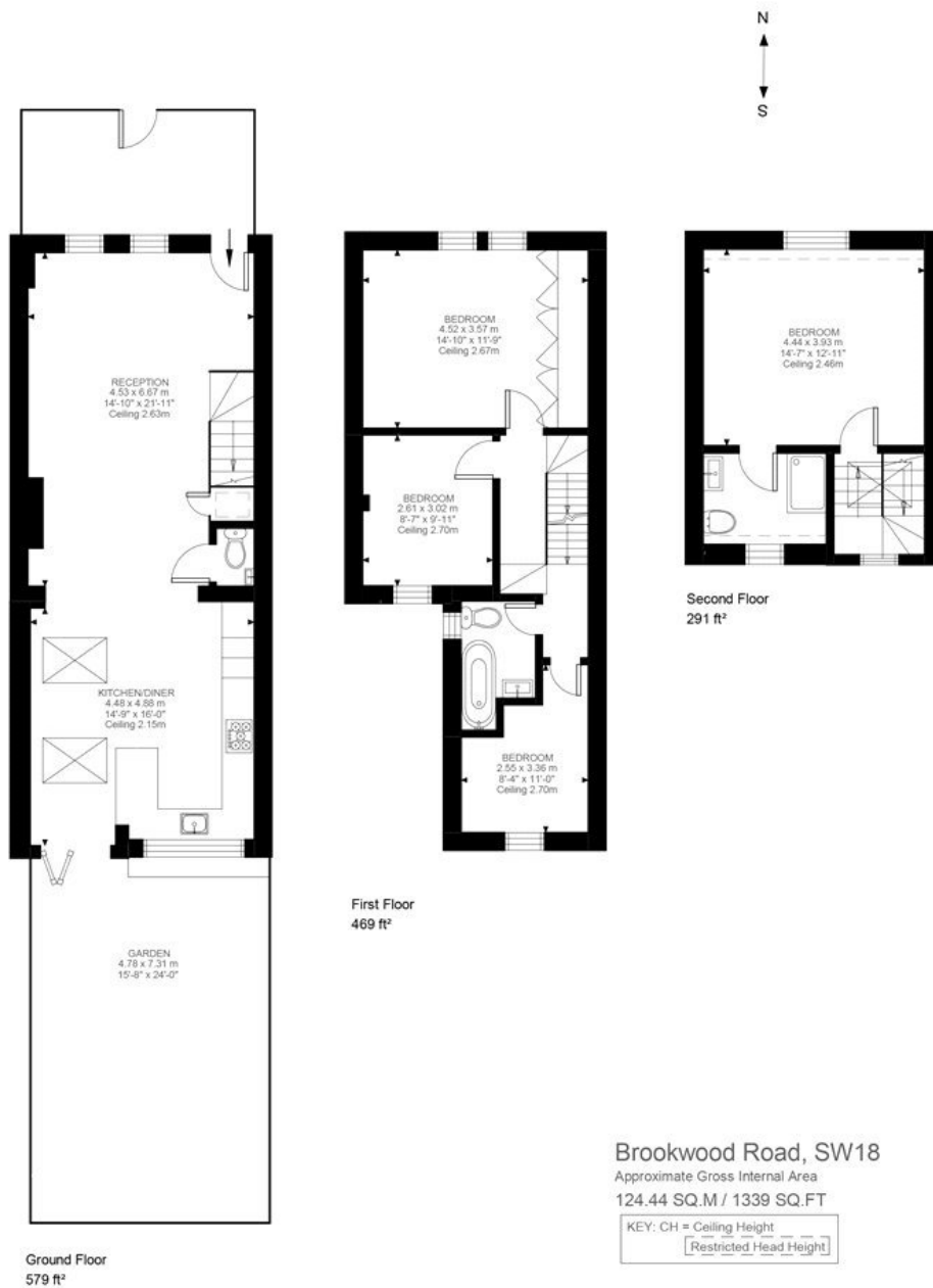
Illustration for identification purposes only. Not to scale. Floor Plan Drawn According To RICS Guidelines.

This floorplan is for illustration purposes only and is not to scale. The position and size of doors, windows, appliances and other features are approximate.