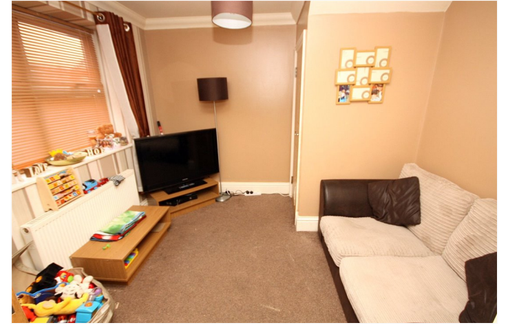
MAYA COURT, WIMBORNE ROAD, WINTON, BOURNEMOUTH, DORSET, BH9