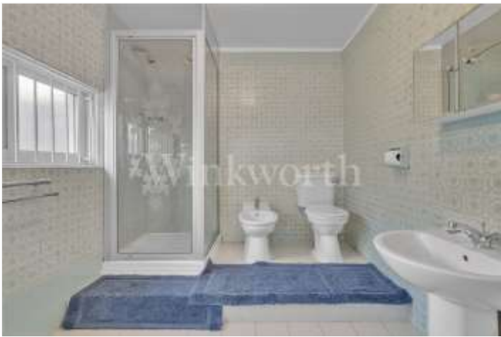
HIGHCROFT GARDENS, NW11 £1,050,000 FREEHOLD