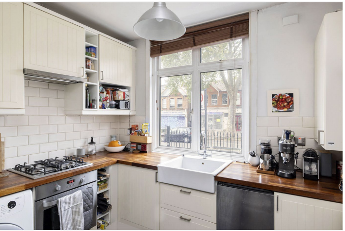
PEABODY ESTATE, SE24 £1,350 PER MONTH PART FURNISHED