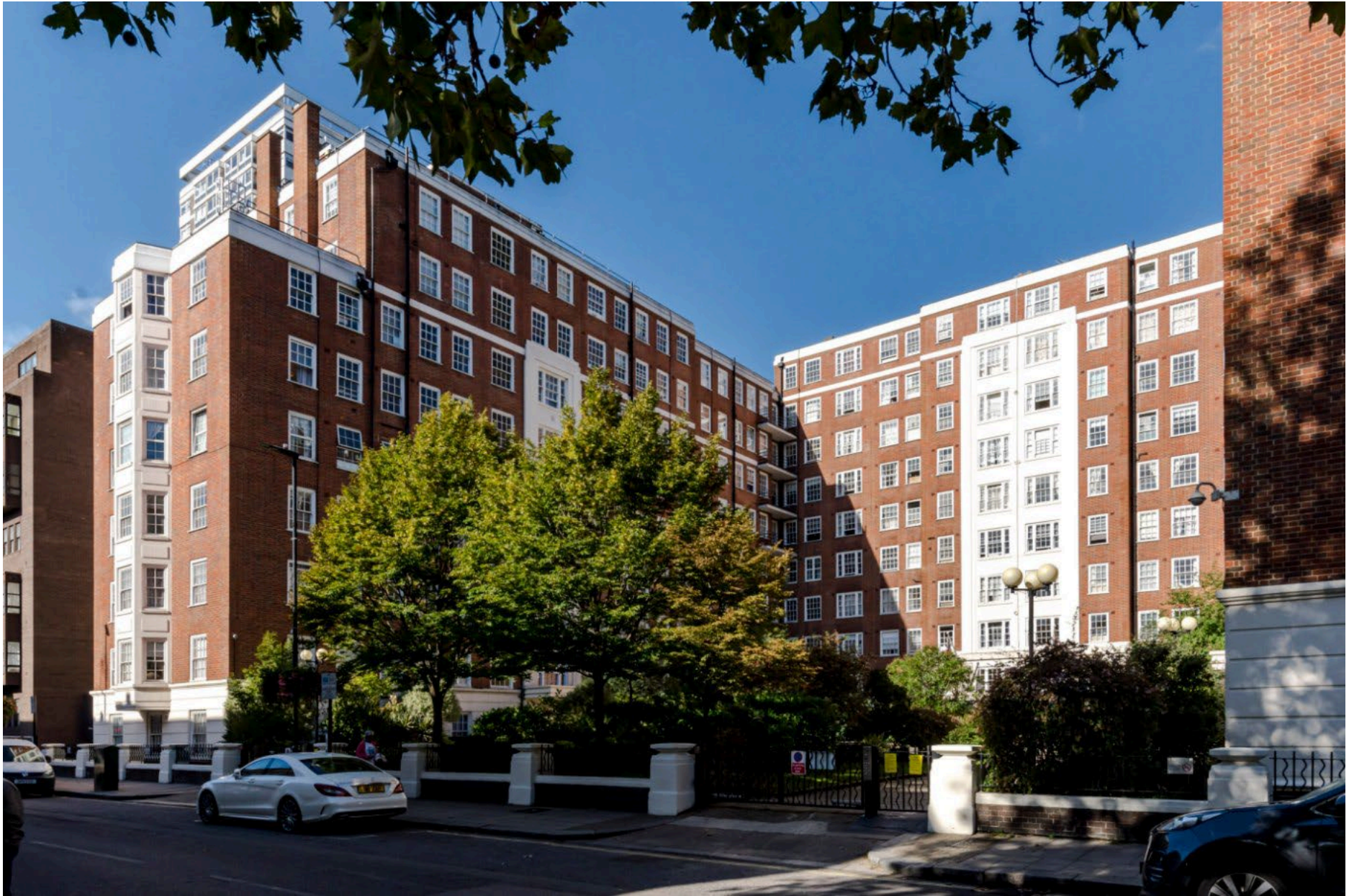
PARK WEST, HYDE PARK ESTATE, W2 £400,000 LEASEHOLD