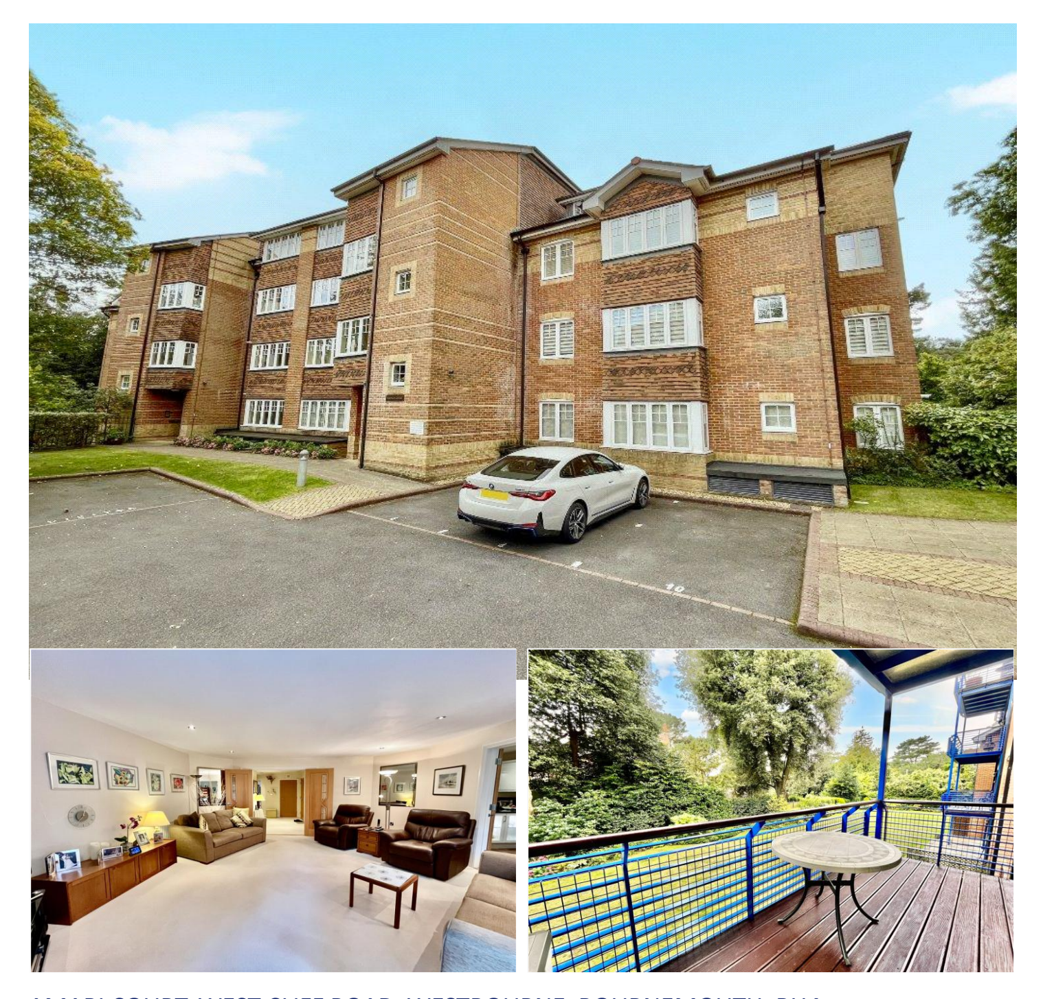
AMARI COURT, WEST CLIFF ROAD, WESTBOURNE, BOURNEMOUTH, BH4