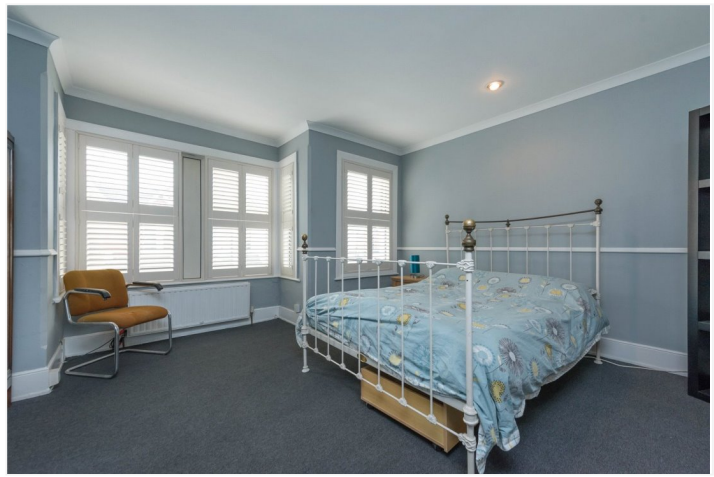
CHAPTER ROAD, NW2 £2,750 PER MONTH PART FURNISHED