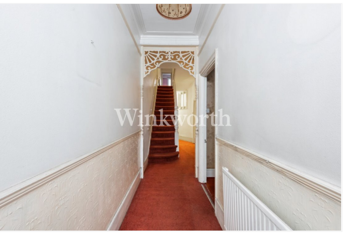
HARDWICKE ROAD, N13 £745,000 FREEHOLD

A FOUR BEDROOM PERIOD HOUSE WITH SPACIOUS ACCOMMODATION, LOCATED CLOSE TO PUBLIC TRANSPORT LINKS INTO THE CITY AND THE WEST END.