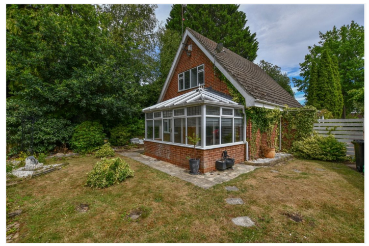
97A FOXCOTE, FINCHAMPSTEAD, WOKINGHAM, BERKSHIRE, RG40 3PG £550,000 FREEHOLD

A WONDERFUL THREE/FOUR BEDROOM DETACHED CHALET BUNGALOW LOCATED ON THIS EVER POPULAR ROAD AND OFFERED TO THE MARKET WITH NO ONWARD CHAIN.