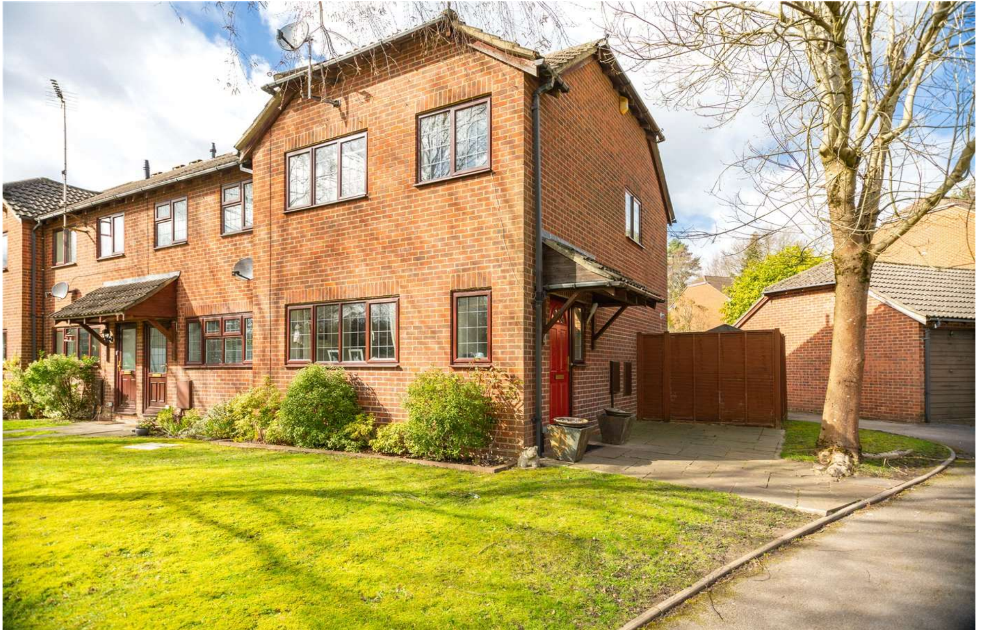
STANMORE CLOSE, ASCOT, BERKSHIRE, SL5 £1,395 PCM