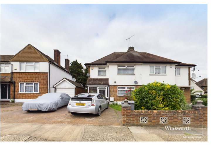
MELBURY ROAD, MIDDLESEX, HA3 £585,000 FREEHOLD