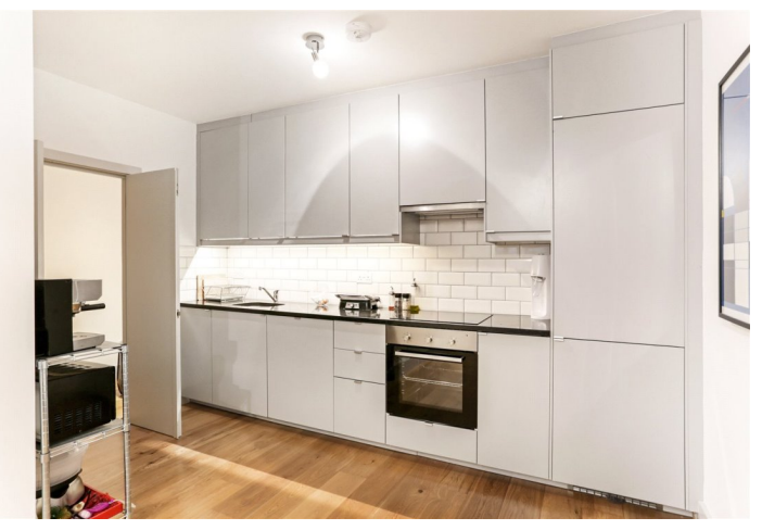
ST STEPHENS AVENUE, SHEPHERDS BUSH, LONDON, W12 £2,650 PER MONTH FURNISHED, PART FURNISHED £2,650 PER CALENDAR MONTH

A delightfully modern two double bedroom patio flat with it's own entrance. Furnished. Available immediately