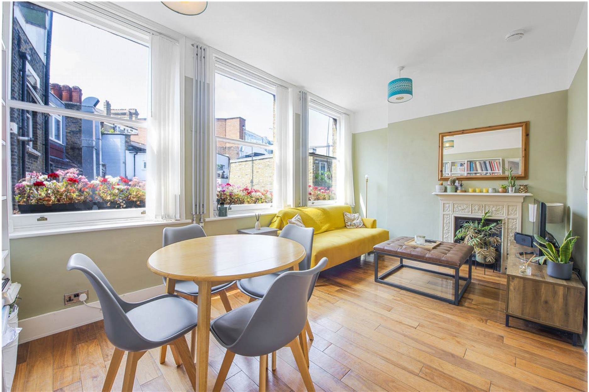
VINE HILL, LONDON, EC1R £575,000 LEASEHOLD