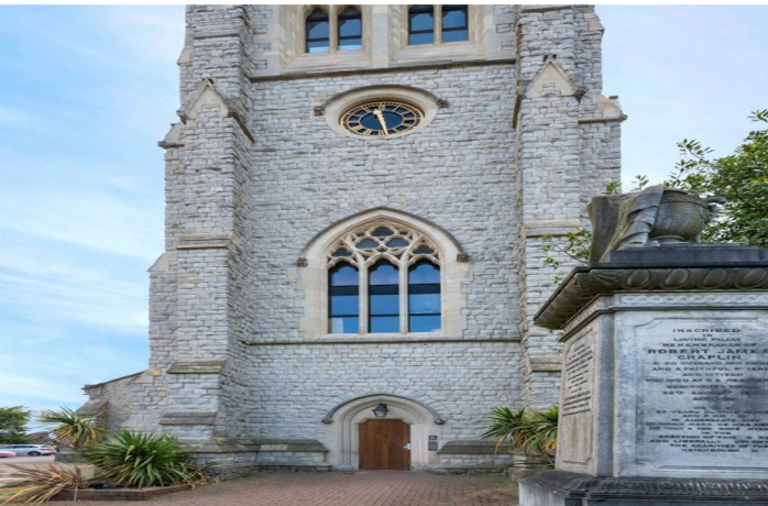
APARTMENT 7, THE APOSTLES, CHURCH RISE, FOREST HILL, SE23 £500,000 LEASEHOLD