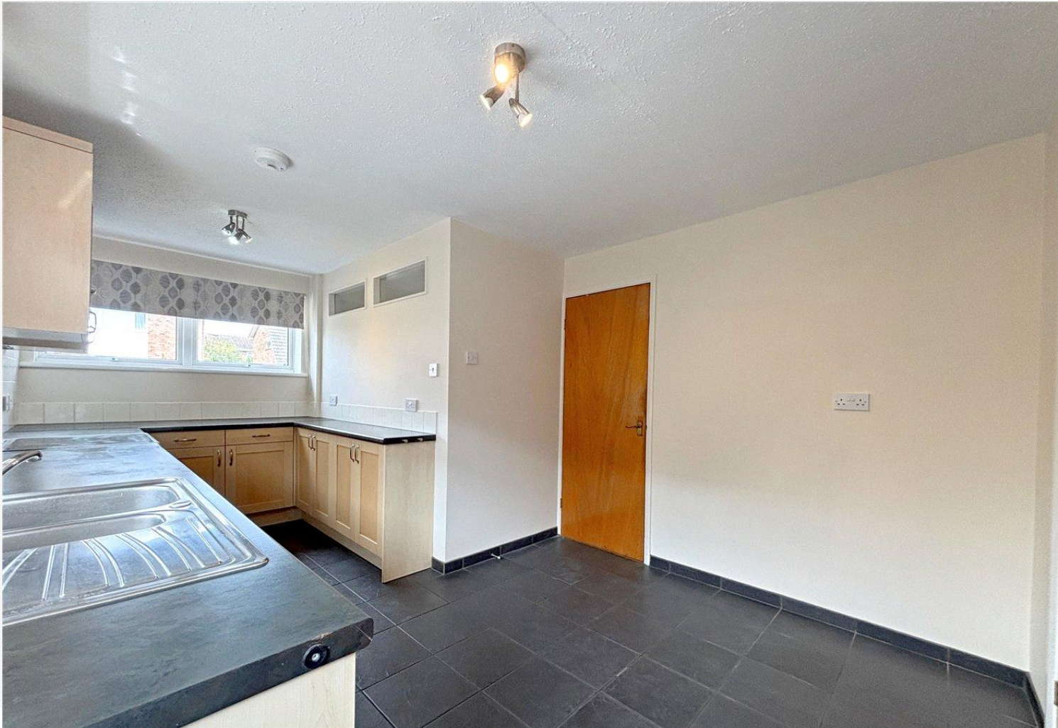
The accommodation comprises of Entrance Hall, Lounge/Diner, Kitchen, Two Double Bedrooms & Family Bathroom.

Outside, to the front of the property there is a lawned area with pathway leading to the Entrance Door, along with a concrete driveway offering ample off street parking. The rear garden is of particular note, being well maintained, principally laid to lawn and non-overlooked.