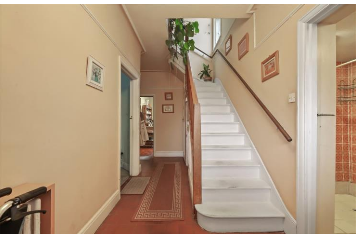
LILLIAN AVENUE, LONDON, W3 OFFERS IN EXCESS OF £850,000 FREEHOLD