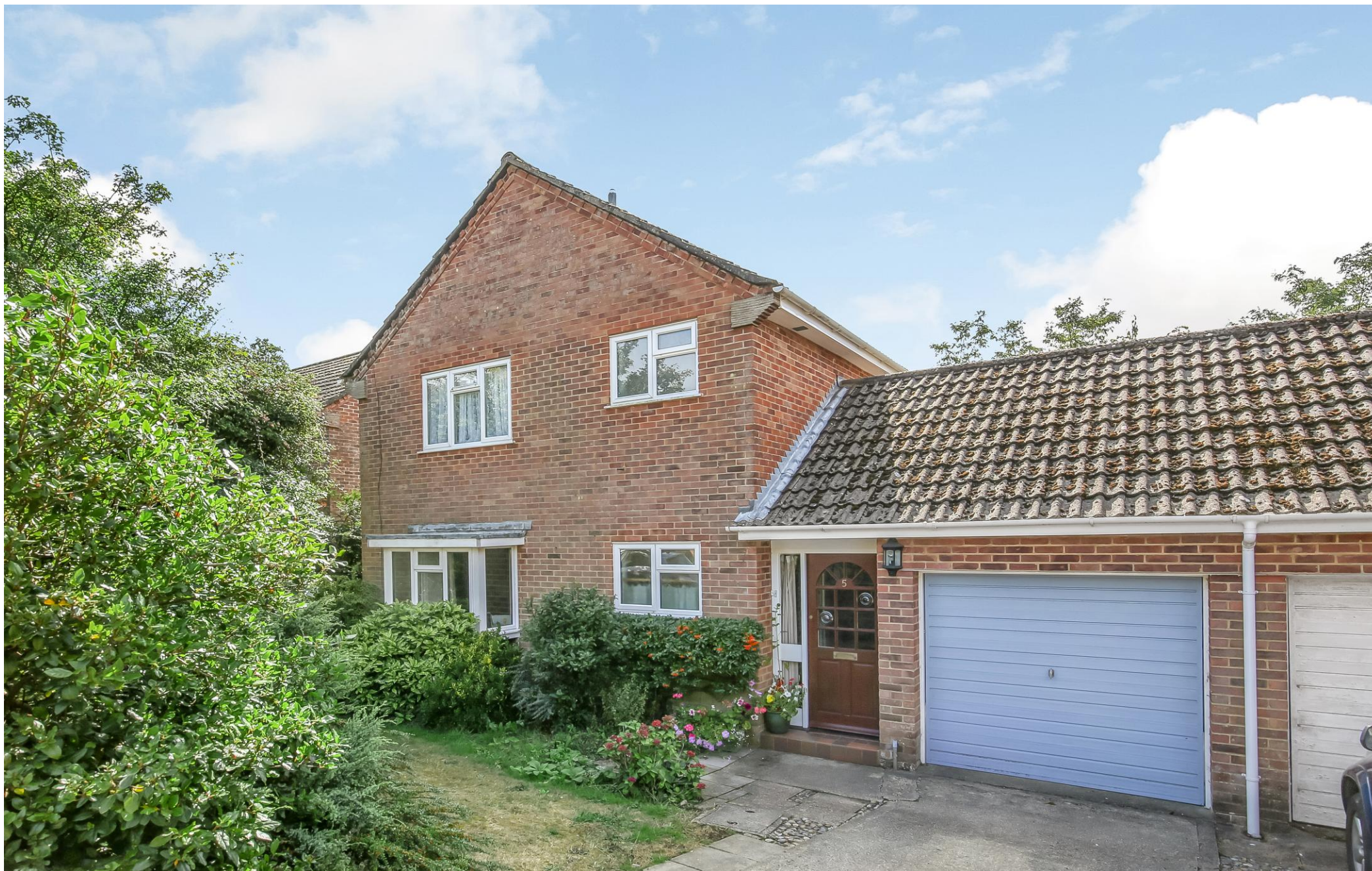
5 The Triangle, Whiteparish, Salisbury, Wiltshire, SP5 2RT