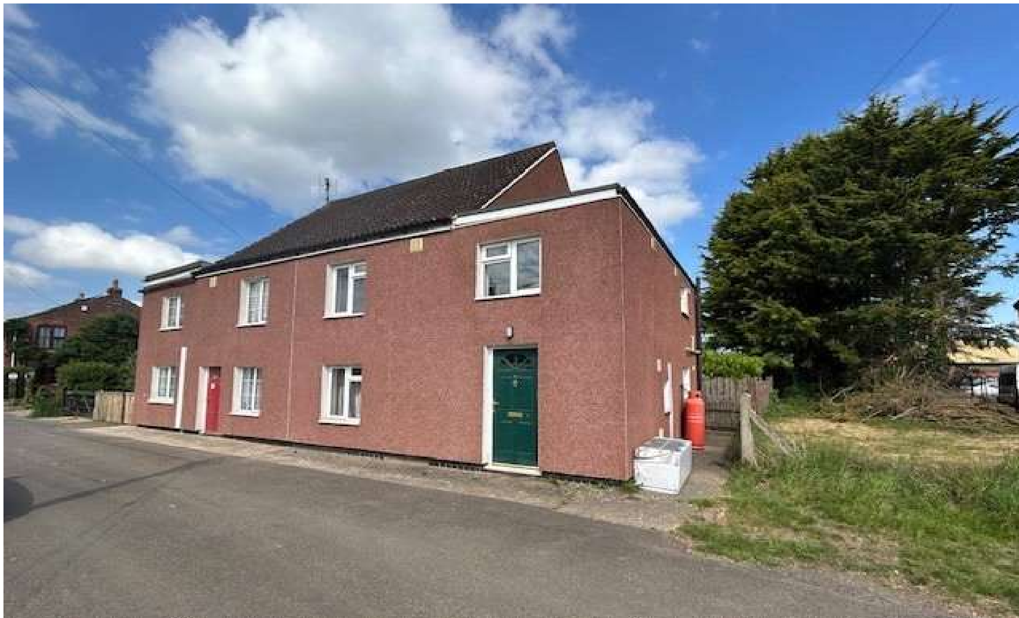
4 WHITELEATHER SQUARE, BILLINGBOROUGH, LINCOLNSHIRE, NG34 0QP £180,000 FREEHOLD