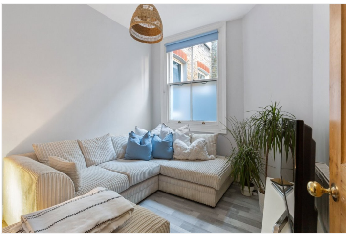
REVELSTOKE ROAD, SW18 £2,100 PER MONTH UNFURNISHED

A beautifully presented two bedroom maisonette with a private garden in the heart of the Southfields Grid