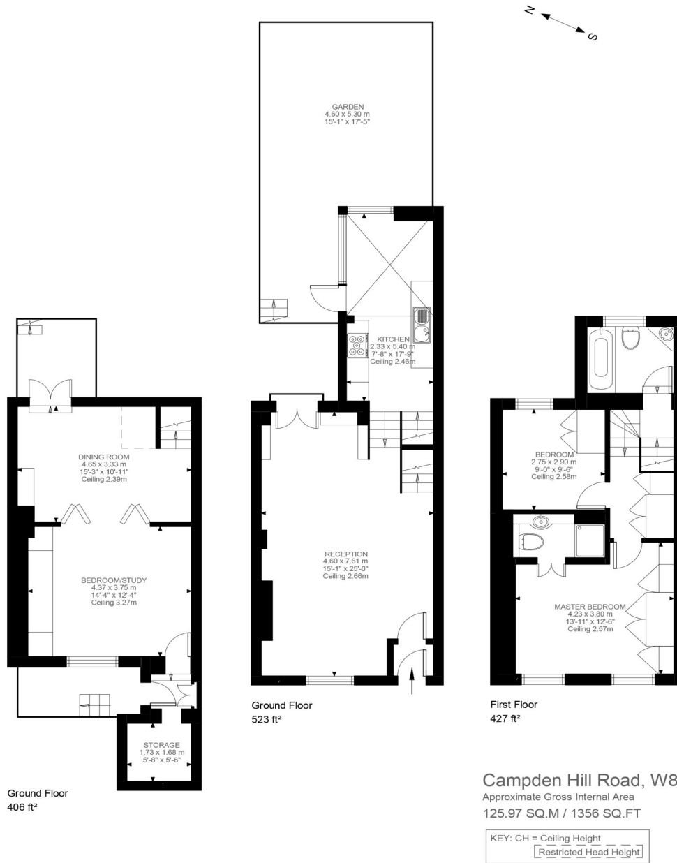
Illustration for identification purposes only. Not to scale. Floor Plan Drawn According To RICS Guidelines.

This floorplan is for illustration purposes only and is not to scale. The position and size of doors, windows, appliances and other features are approximate.