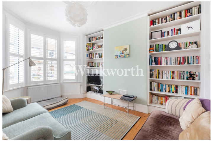
BEECHFIELD ROAD, N4 £825,000 FREEHOLD