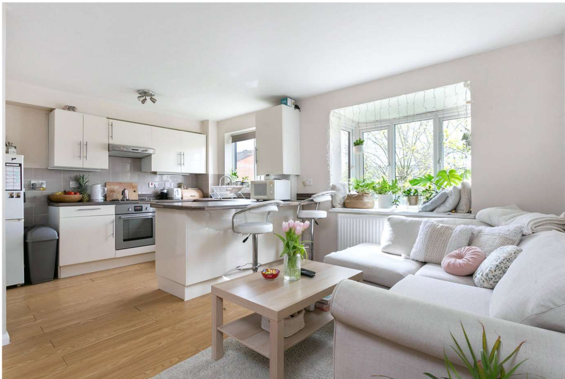
BOWMAN MEWS, SW18 £1,750 PER MONTH UNFURNISHED