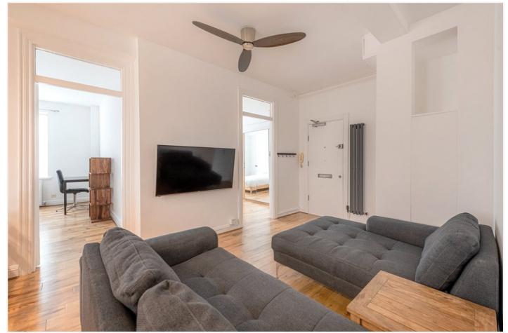
LANCASTER ROAD, W11 £700,000 SHARE OF FREEHOLD