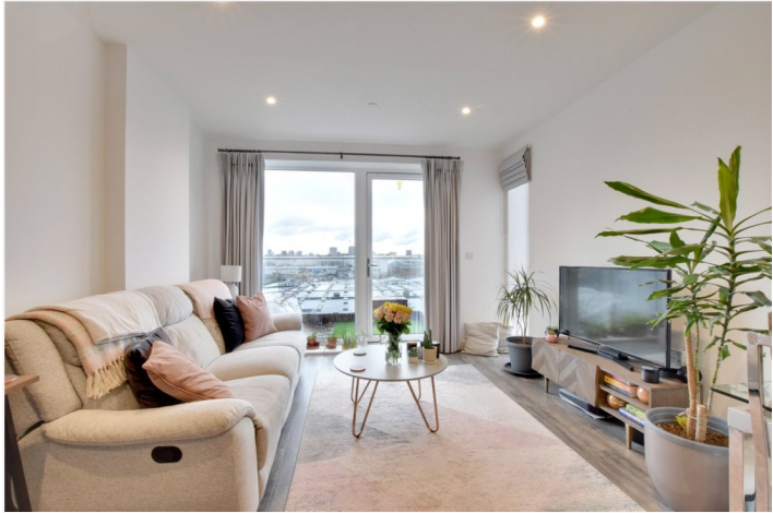
HULFORD APARTMENTS, CHARLTON, LONDON, SE7 £365,000 LEASEHOLD

WE ARE DELIGHTED TO OFFER THIS IMMACULATE ONE BEDROOM, 5TH FLOOR, APARTMENT THAT MEASURES CIRCA 584 SQ FT AND IS WELL LOCATED JUST MOMENTS FROM CHARLTON MAINLINE RAIL.