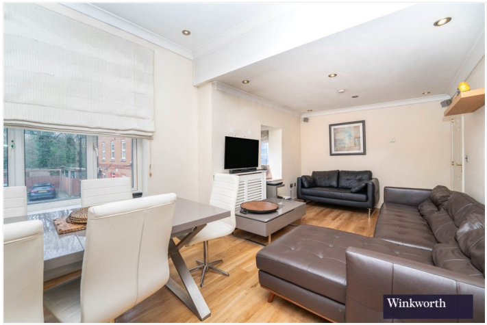
ROSS CLOSE, MIDDLESEX, UB5 £430,000 FREEHOLD