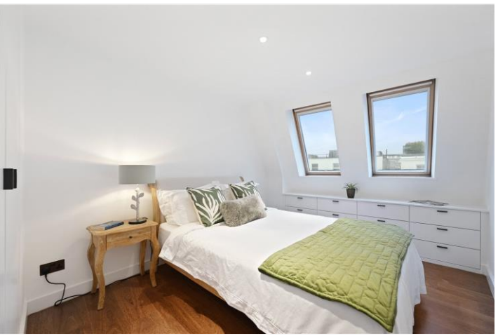
RODNEY HOUSE, LONDON, W11 £900 PER WEEK (£3,900.00 PCM) FURNISHED

A BEAUTIFULLY PRESENTED AND WONDERFULLY BRIGHT TWO DOUBLE BEDROOM TWO BATHROOM FLAT ON THE TOP FLOOR OF THIS MODERN BUILDING LOCATED ON THIS HIGHLY SOUGHT-AFTER STREET.