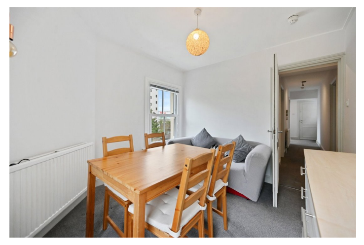
UXBRIDGE ROAD, LONDON, W12 £2,650 PER CALENDAR MONTH

A recently redecorated three bedroom flat overlooking Shepherds Bush Green. Furnished, Available 17th June 2025