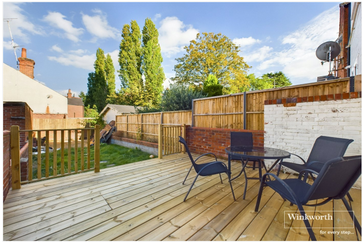
CRANBURY ROAD, READING, BERKSHIRE, RG30 GUIDE PRICE £325,000 FREEHOLD