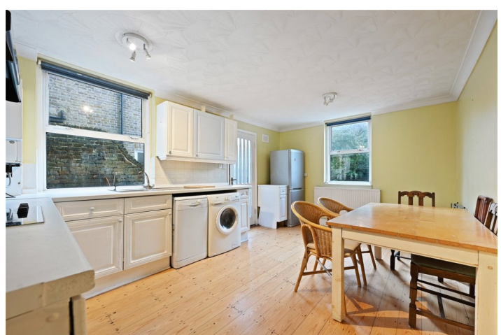
BLOEMFONTEIN ROAD, LONDON, W12 £2,795 PER MONTH FURNISHED £2,795 PER CALENDAR MONTH

A light and spacious three bedroom ground and lower ground floor flat. Furnished, Available immediately