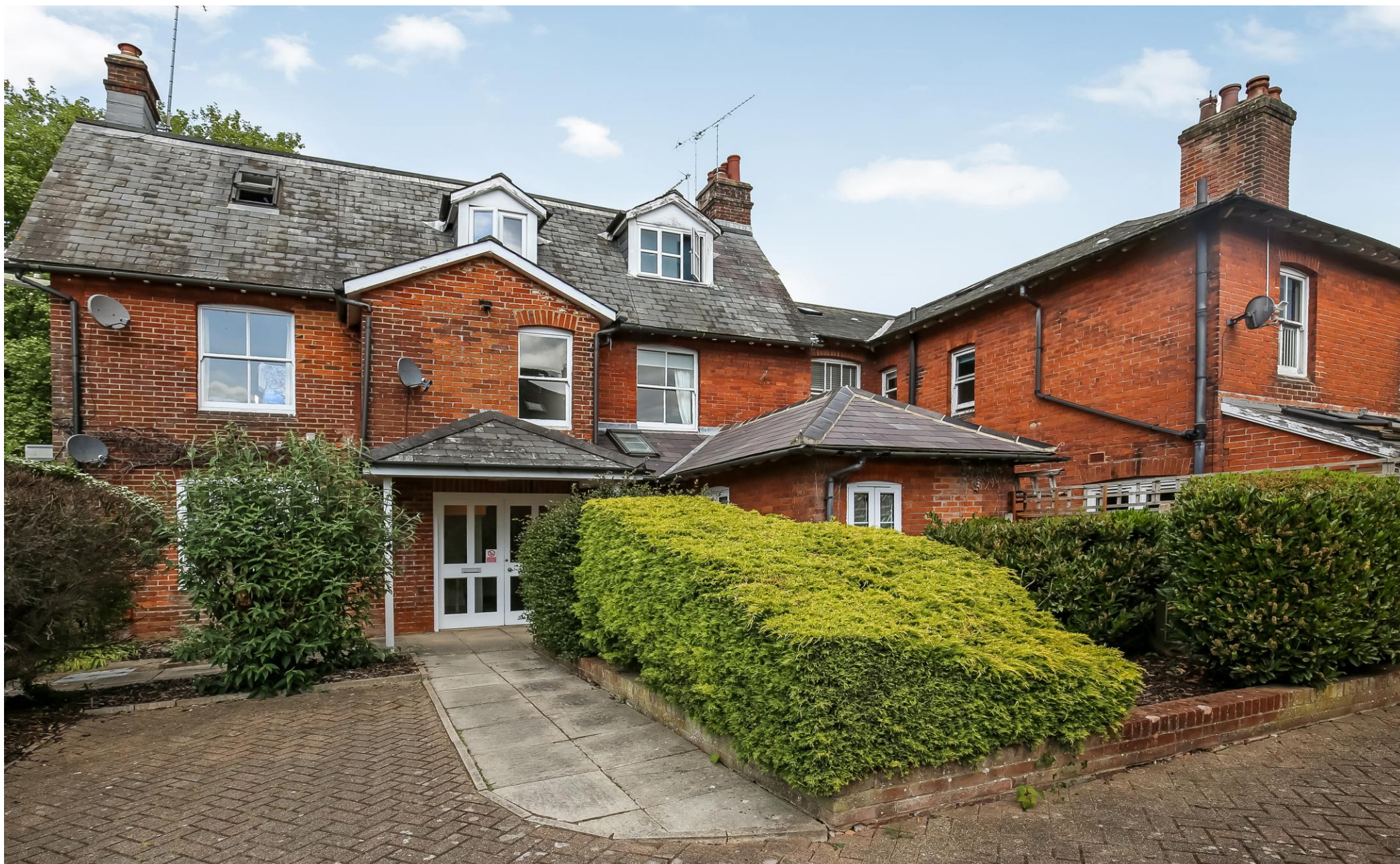
Benson Court, 66 North Walls, Winchester, Hampshire, SO23 8DP