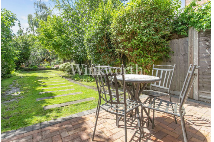
MEADOWCROFT ROAD, N13 GUIDE PRICE £525,000 SHARE OF FREEHOLD

A SUPERB GROUND FLOOR FLAT IN A CONVENIENT LOCATION WITH A CHARMING SOUTH-FACING REAR GARDEN.