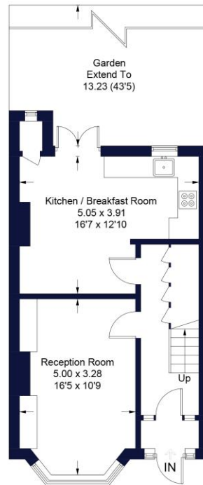
Ground Floor Sq m 44.9 / Sq ft 483