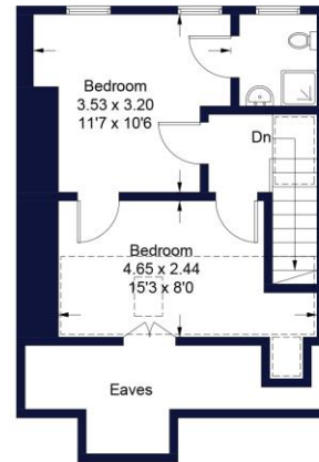
Second Floor Sq m 35.7 / Sq ft 385