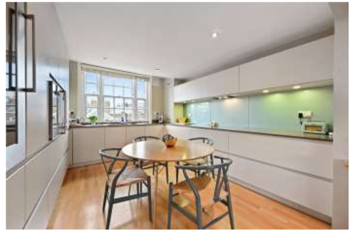
HARLEY STREET, LONDON, W1G £4,000,000 SHARE OF FREEHOLD

AN IMPRESSIVE TRIPLEX APARTMENT FORMING THE UPPER THREE FLOORS OF A HANDSOME AND ARCHITECTURALLY SIGNIFICANT REDBRICK AND PORTLAND STONE GRADE II LISTED EDWARDIAN TOWNHOUSE, SET IN A PRIME MARYLEBONE LOCATION.