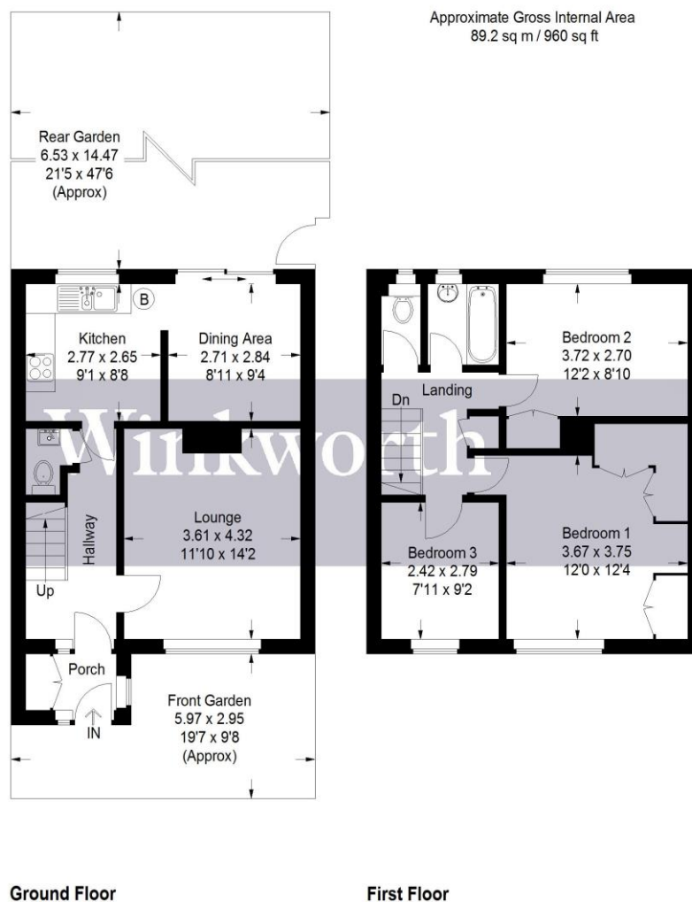
Illustration for identification purposes only, measurements are approximate, not to scale. Winkworth © 2018 (ID 499204)