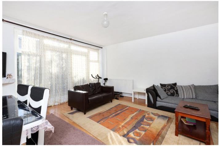
FELLOWS COURT, WEYMOUTH TERRACE, LONDON, E2 £550,000 LEASEHOLD