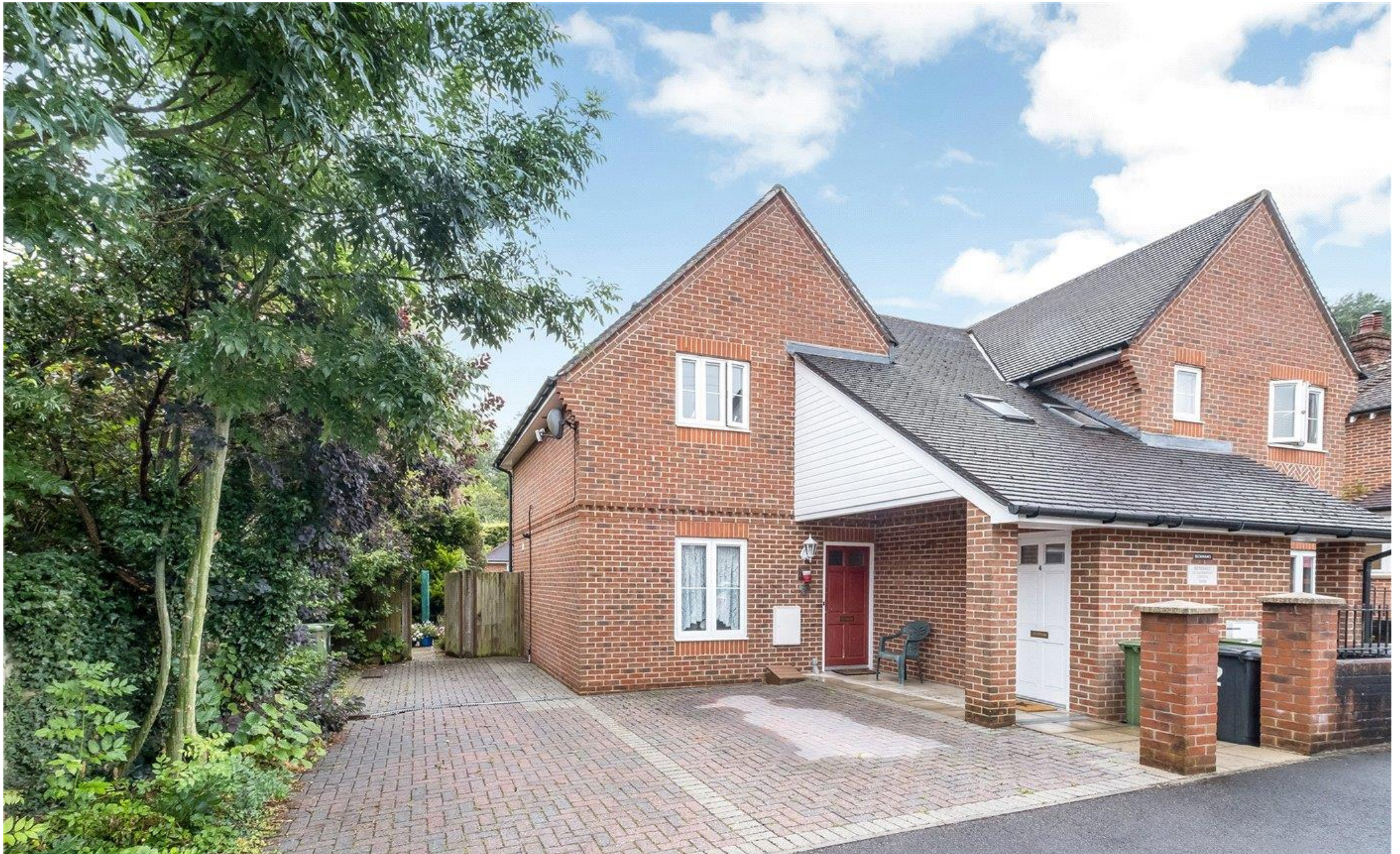
Benhams, Bentley Close, Winchester, Hampshire, SO23 7FG