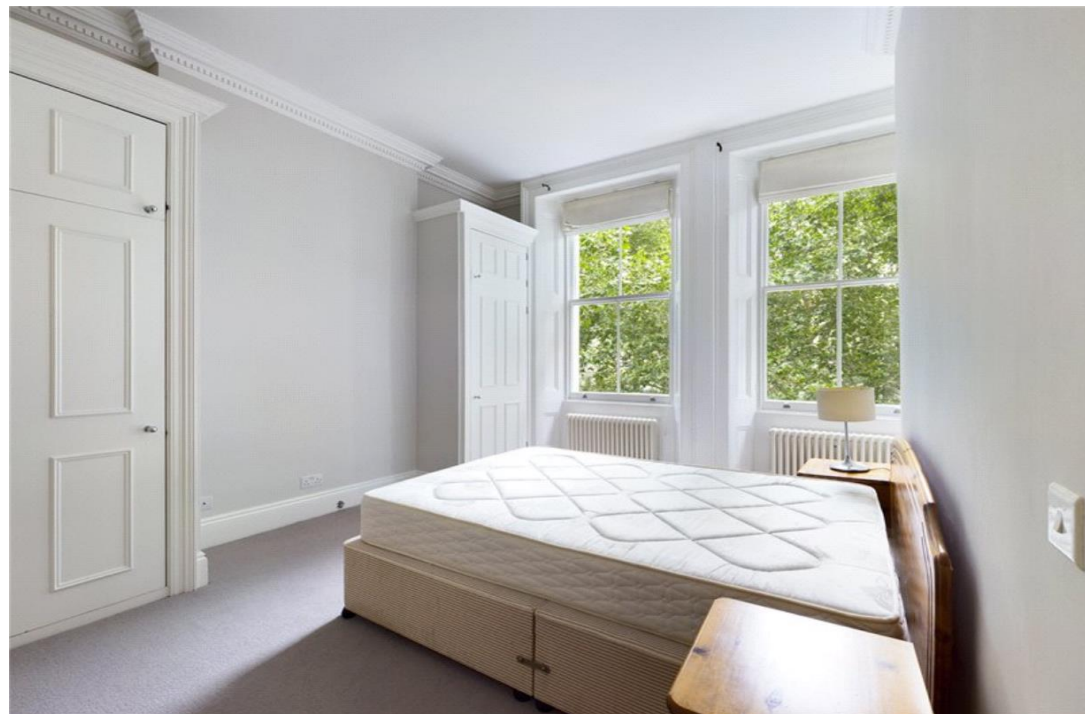
Two Double Bedrooms | Two Bathrooms | large Roof Terrace