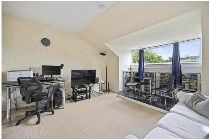
ELSHAM ROAD, W14 £300,000 LEASEHOLD

A BRIGHT ONE BEDROOM FLAT SITUATED ON THE THIRD FLOOR OF A BROAD VICTORIAN TERRACED HOUSE.