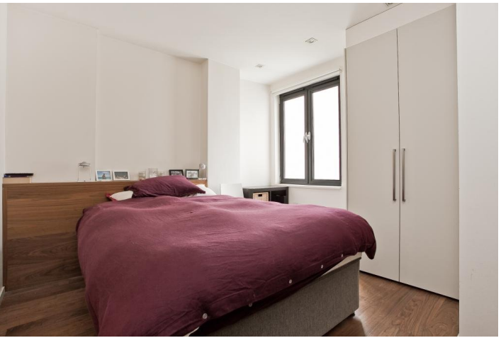
BEVENDEN STREET, N1 £395 PER WEEK FURNISHED