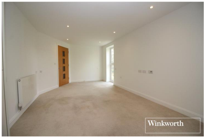
STUDIO WAY, HERTFORDSHIRE, WD6 £300,000 LEASEHOLD